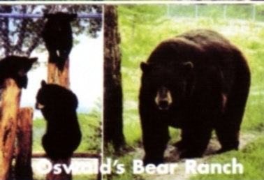
Oswald's Bear Ranch