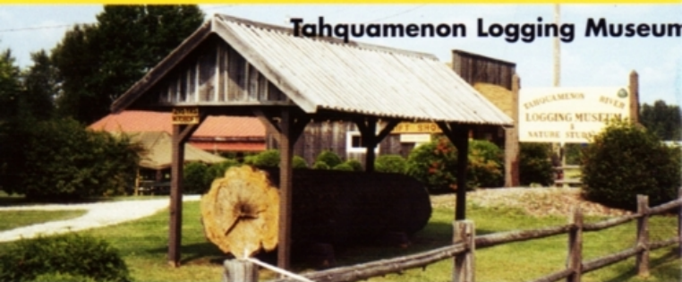
Tahquamenon Logging Museum